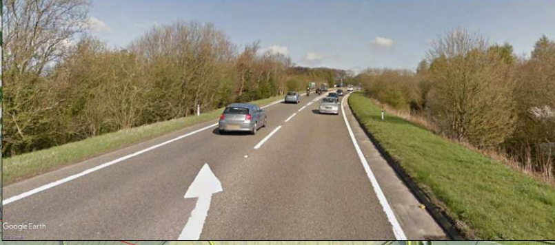
AFTER - REPURPOSED A47 - for location see A artist's impression